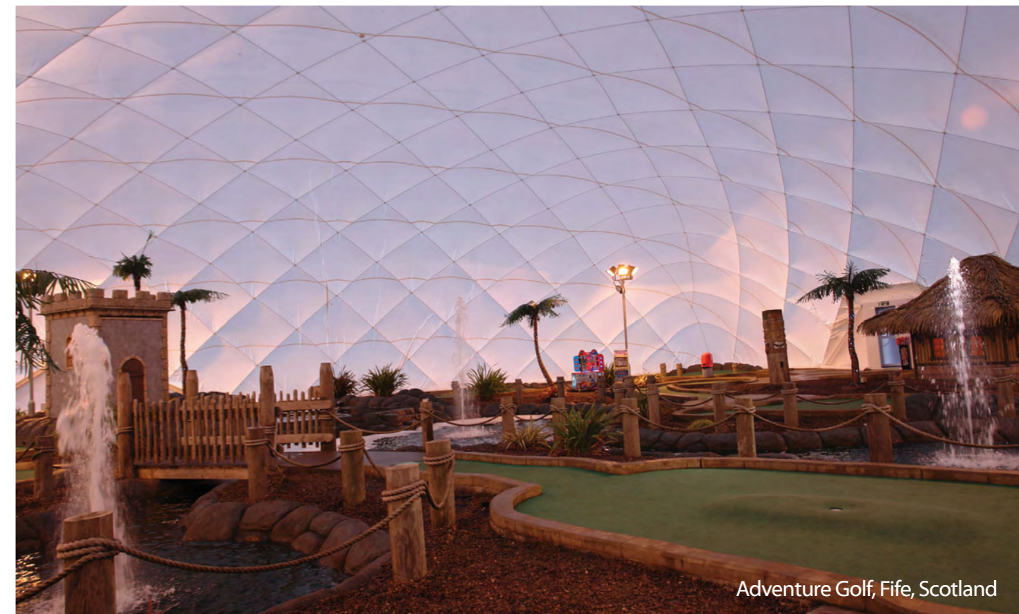
Adventure Golf, Fife, Scotland