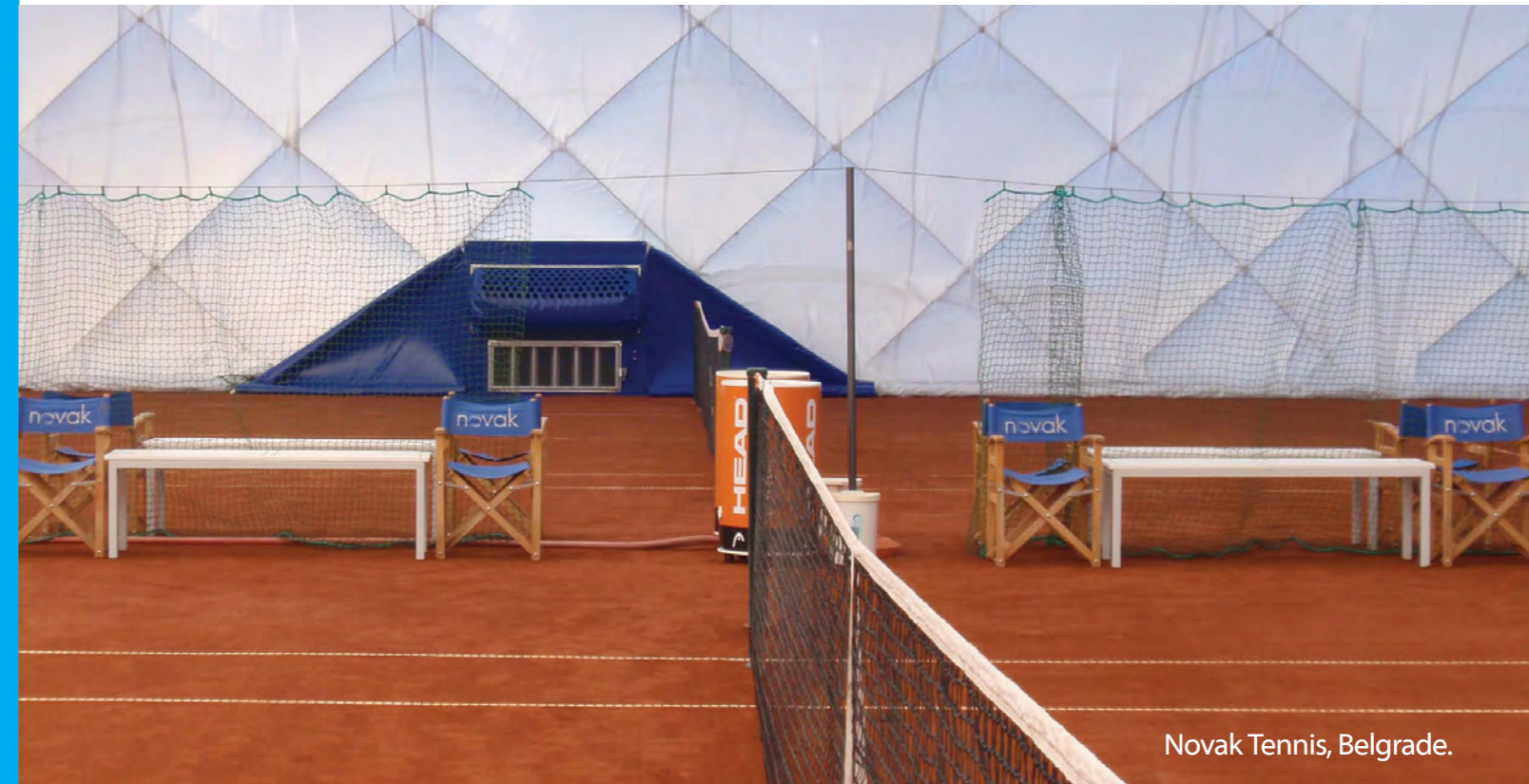
Novak Tennis, Belgrade.