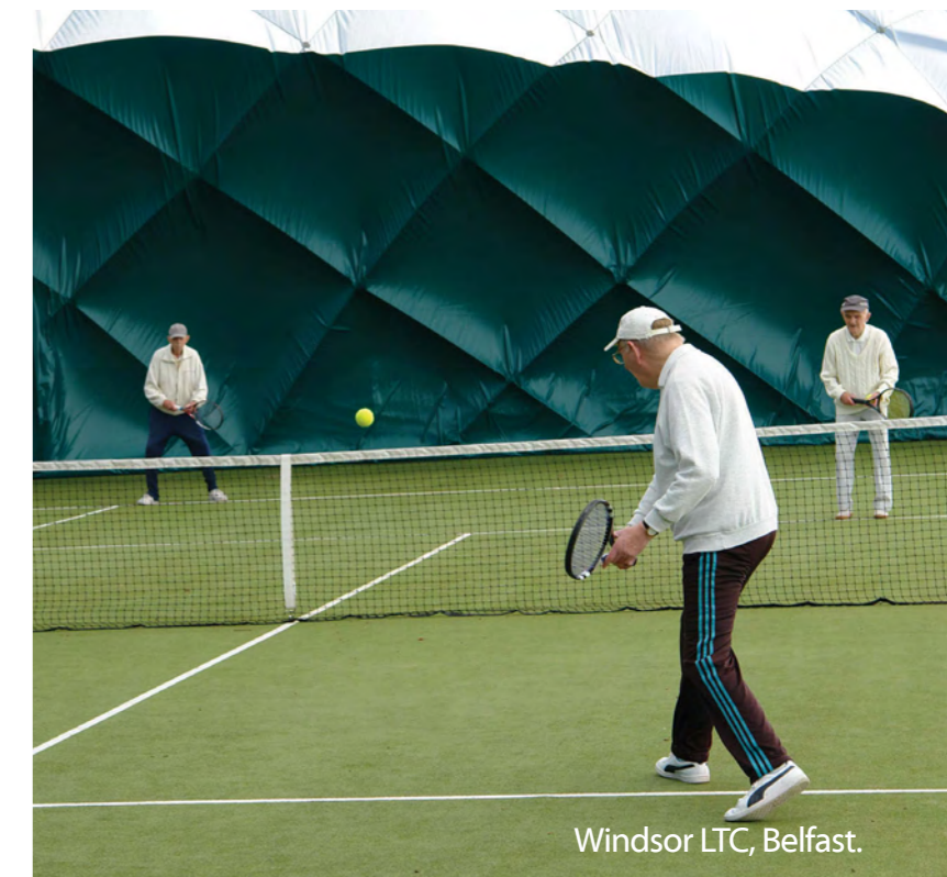
Windsor LTC, Belfast.

“ROCKLYN DOMES PROVIDE A LONG-LASTING AND FLEXIBLE MEANS OF COVERING OUTDOOR SPORTING AREAS. THEIR ADVANTAGES INCLUDE THE ABILITY TO WITHSTAND EXTREME WEATHER CONDITIONS AND THE UNIQUE ‘PRESSURE-FRAME’ SYSTEM WHICH SEALS THE STRUCTURE AT THE BASE”